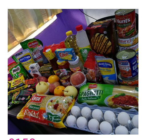
£150 donation provides 5 emergency food parcels for a family for a week.