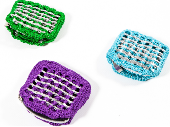
BIGGER COIN PURSES £5 available in royal blue, red, green, silver, turquoise, pink, purple, multi or gold