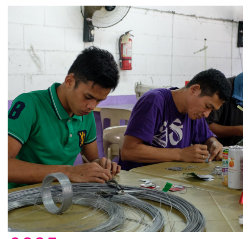
£305 donation provides tuition fees for a teenager to learn a practical trade.