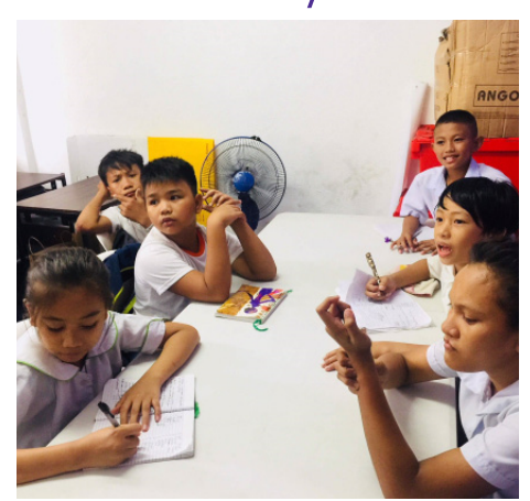
£5 a month over a year provides school supplies for 10 students.