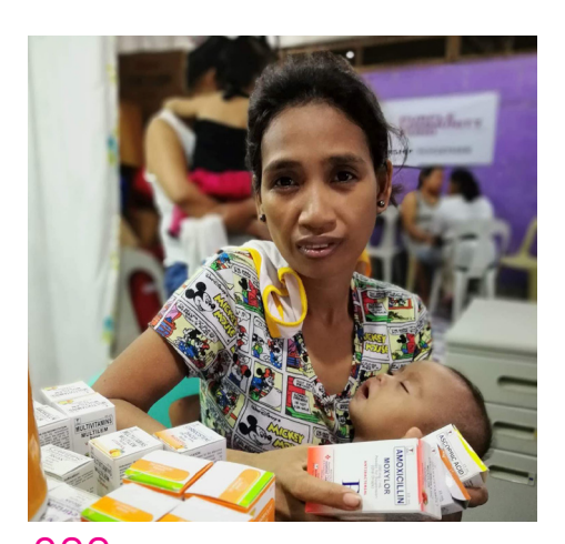
£30 donation provides 5 hospital lab tests or a baby pack for a newborn.