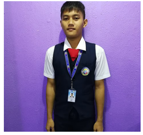
£22 donation provides a child with a new school uniform.