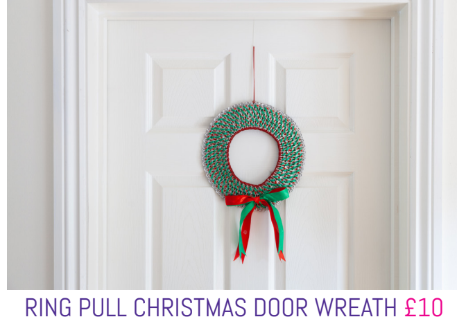
RING PULL CHRISTMAS DOOR WREATH £10 available in silver ring pulls with either red or green ribbon