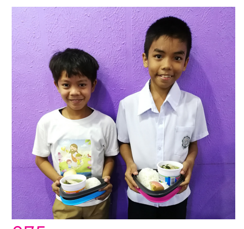
£75 donation provides a hot nutritious meal for 5 children for a month.