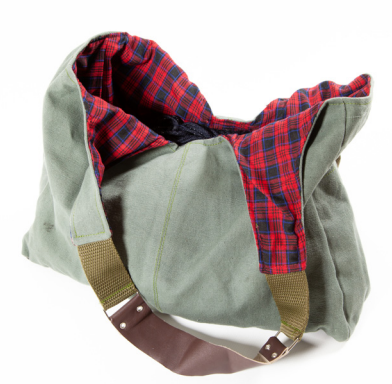
SLOUCH BAG £25 authentic Tanzanian fabric with real leather strap