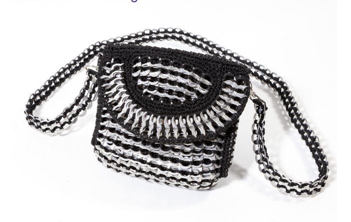
BERNIE BAG £30 available in black, silver or red & black