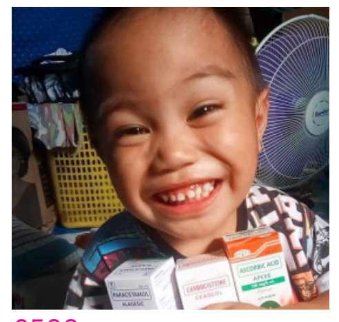
£500 donation provides medicines for our walk in clinic for 4 months.