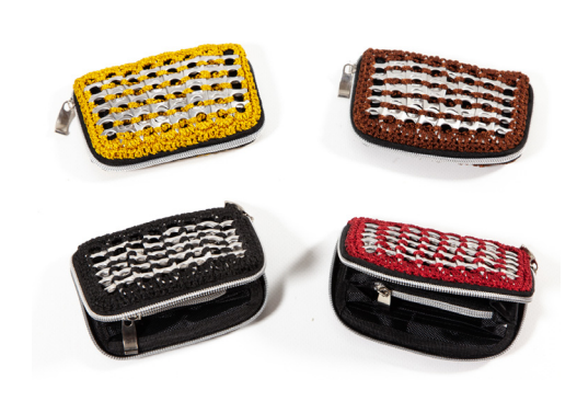
ELLIE PURSE £10 available in mustard, red, chocolate, cream or black