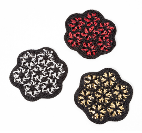
MUG MATS £5 each or 4 for £15 available in silver, red, or gold

To order your Purple Products please visit our online shop w: p-c-f.org/shop or call us in the office t: 01489 790 219