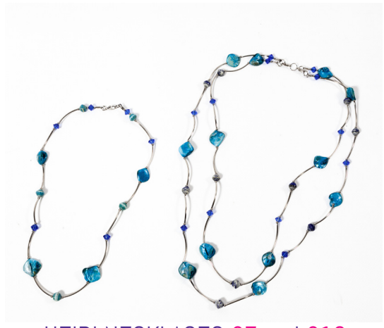
HEIDI NECKLACES £7 and £10 available in red, blue, brown, black, pink or purple