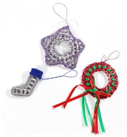
CHRISTMAS DECORATIONS £3 each or 4 for £10

We have some exciting new products that our amazing artisans have made in the Philippines. 100% of the profit from the products sales goes back into our programmes.