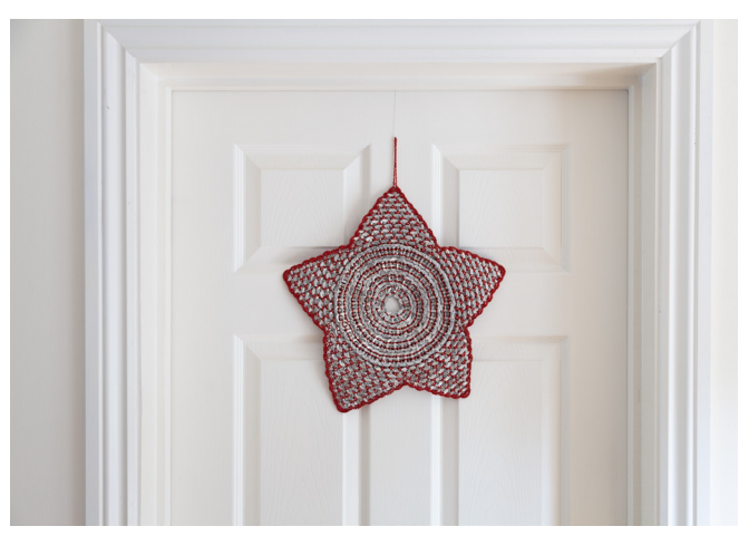
RING PULL CHRISTMAS DOOR STAR £10 available in gold, silver, red or green