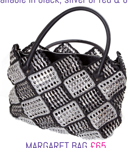
MARGARET BAG £65 with real leather handles