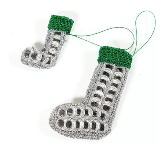
CHRISTMAS STOCKING (colours will vary) LARGE £6 each 2 for £10 SMALL £3 each 2 for £5