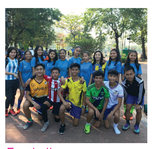
Football we have restarted our football club. The students are so grateful for the opportunity to play football again.