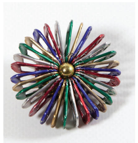
RING PULL BROOCH £5 available in blue, gold, green, rainbow, red, silver and blue & gold

We have some exciting new products that our amazing artisans have made in the Philippines. 100% of the profit from the products sales goes back into our programmes.