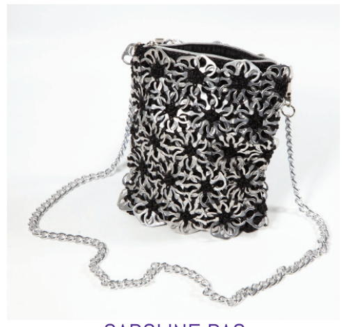
CAROLINE BAG £25

CHRISTMAS WREATH (colours will var LARGE £6 each 2 for £10 SMALL £3 each 2 for £5