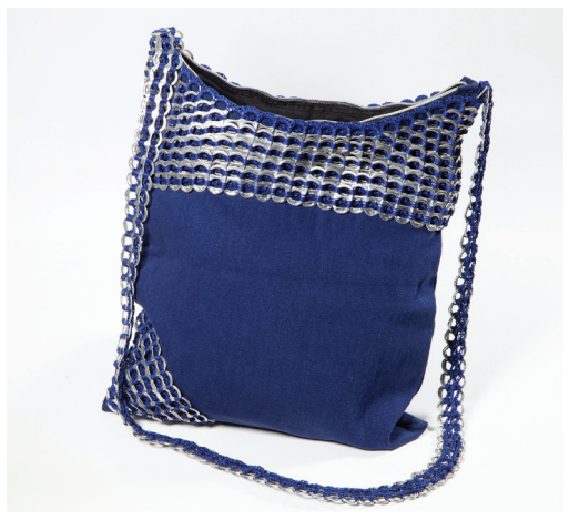
DENIM BAG £20 available in blue and black

We have some exciting new products that our amazing artisans have made in the Philippines. 100% of the profit from the products sales goes back into our programmes.