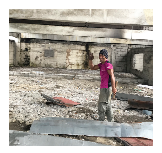
Gym we are currently working on a martial arts and sports gym space in the heart of the slum.