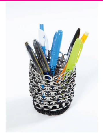
HANDY HOLDER £5

To order your Purple Products please visit our online shop w: p-c-f.org/shop or call us in the office t: 01489 790 219