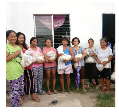
Welfare 1,944 families in crisis are helped every month in our drop in centre.