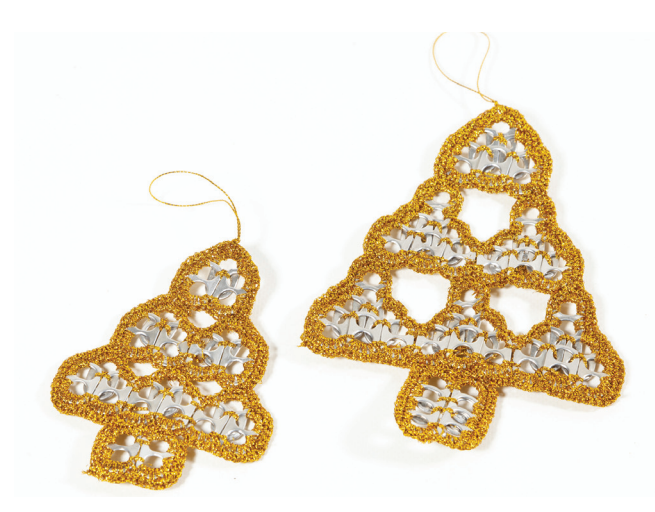
CHRISTMAS TREE (colours will vary) LARGE £6 each 2 for £10 SMALL £3 each 2 for £5