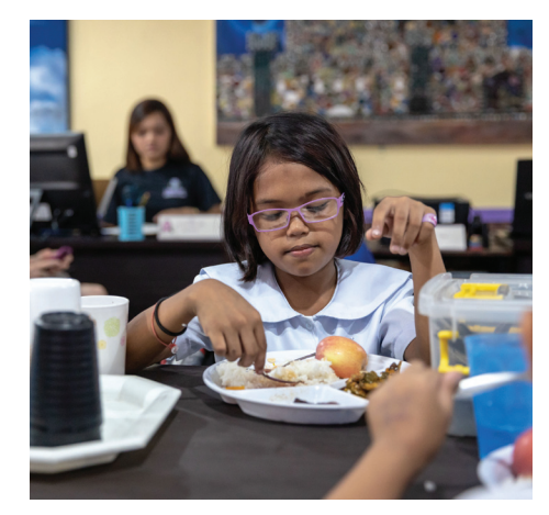
Nutrition our kitchens provide 2,720 meals and packed lunches every month.