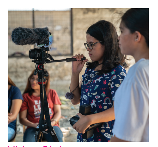
Video Club We secured funding for a new video club giving our students a voice tell their stories. http://bit.ly/PurpleYouTube