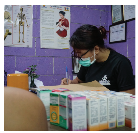
Health our walk in medical clinic helps 360 patients every month.