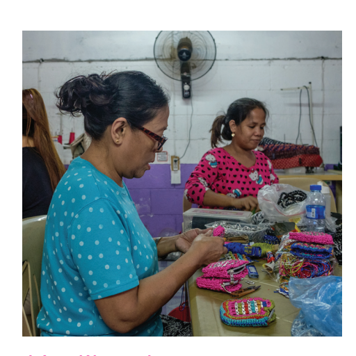
Livelihood our livelihood programmes provide a good reliable income for over 50 men and women.