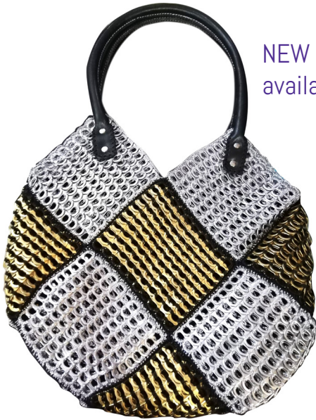
NEW MARY JANE BAG £65 available in gold & silver and silver

To order your Purple Products please visit our online shop w: p-c-f.org/shop or call us in the office t: 01489 790 219