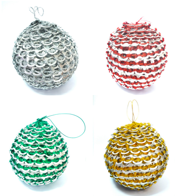
BAUBLES exciting new Christmas decoration 2 for £5 available in silver, gold, red and green

We have some exciting new products that our amazing artisans have made in the Philippines. **100% of the profit from the products sales goes back into our programmes.**