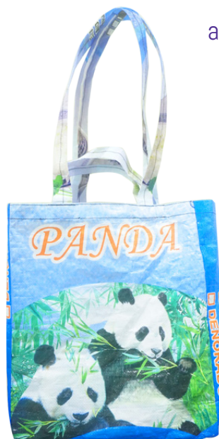
RICE SACK SHOPPER Infinity Foods and our sewers have designed a strong shopping bag £8