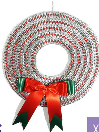
X-Large Silver £30 Gold £35 (15 inches)