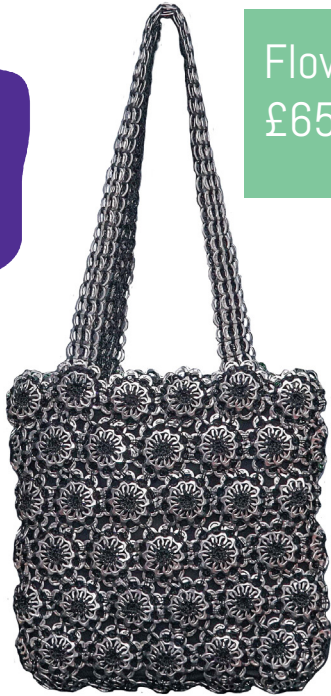
Flower Bag £65

Our handmade belts are both eye catching & durable and available in 3 sizes S, M, L £25