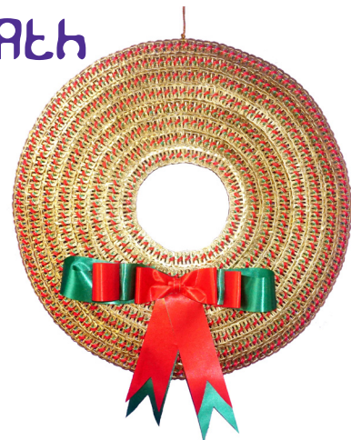
XX-Large Silver £40 Gold £45 (20.5 inches)