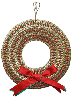
Large Silver £15 Gold £20 (9.5 inches)